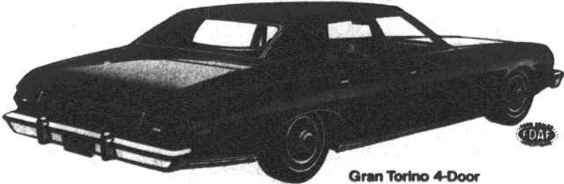
Gran Torino 4-Door