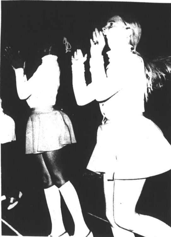
"GO BUCKS!" - Cheerleaders have been in high spirits for the last two games that Hoke High has played. Of course, victory always makes them happy.