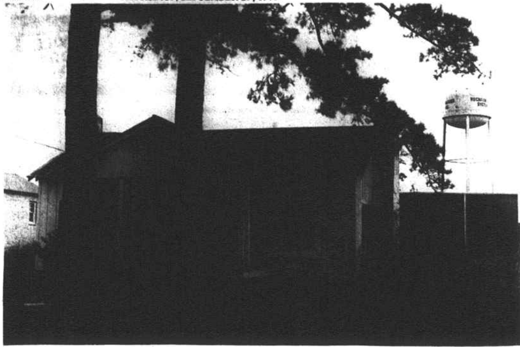
ROCKFISH HOUSE - The seldom used and in need of repair Rockfish Community House has come up for discussion again with talk of selling the building at auction or possibly moving it to another site.