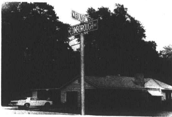
HELPFUL STREET SIGN -- Motorists traveling east on Elwood Avenue may become surprised at the Fulton Street intersection to find they are now on Edinborough Avenue, without ever leaving Elwood. There was no clear explanation for the disappearing street.