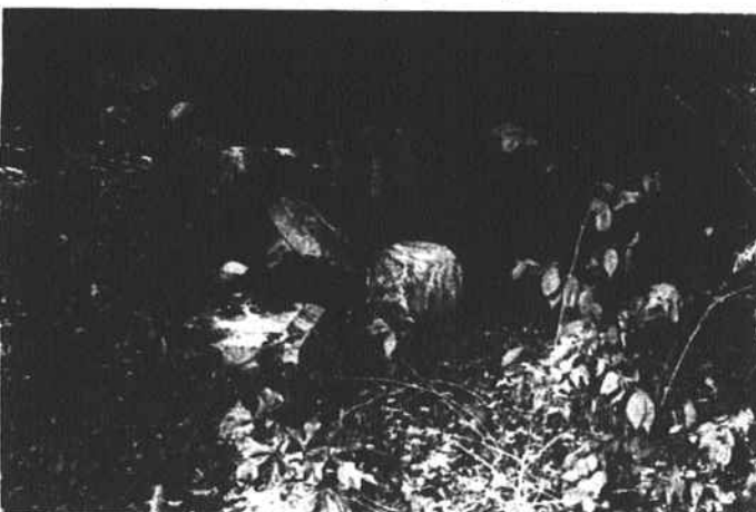
OLD CEMETERY - The McLean Family Cemetery is one of the spots that will be visited by the historical tour Saturday.

However, notes the Agriculture Department, it was the second best year on record. It topped 1972 by a wide margin.