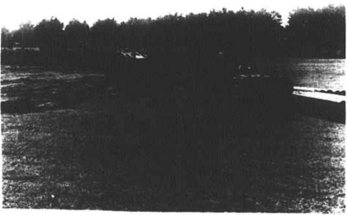
NEW ADDITION - Construction begins on the new vocational section at Hoke High School Monday.