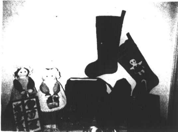
BAZAAR ITEMS - These are some of the handmade articles which will be offered for sale Saturday at the Junior Womans Club bazaar. Proceeds from the sale will benefit the Bicentennial library fund.

The Raeford Junior Womans Club will sponsor a fall craft bazaar Saturday, Nov. 1, at the Edenborough Shopping Center. Among the many craft items being offered will be Christmas decorations and items perfect for Christmas gifts. Sale hours are 10 am to 2 p.m. All profits from this project will be donated to the Hoke County Library Fund.