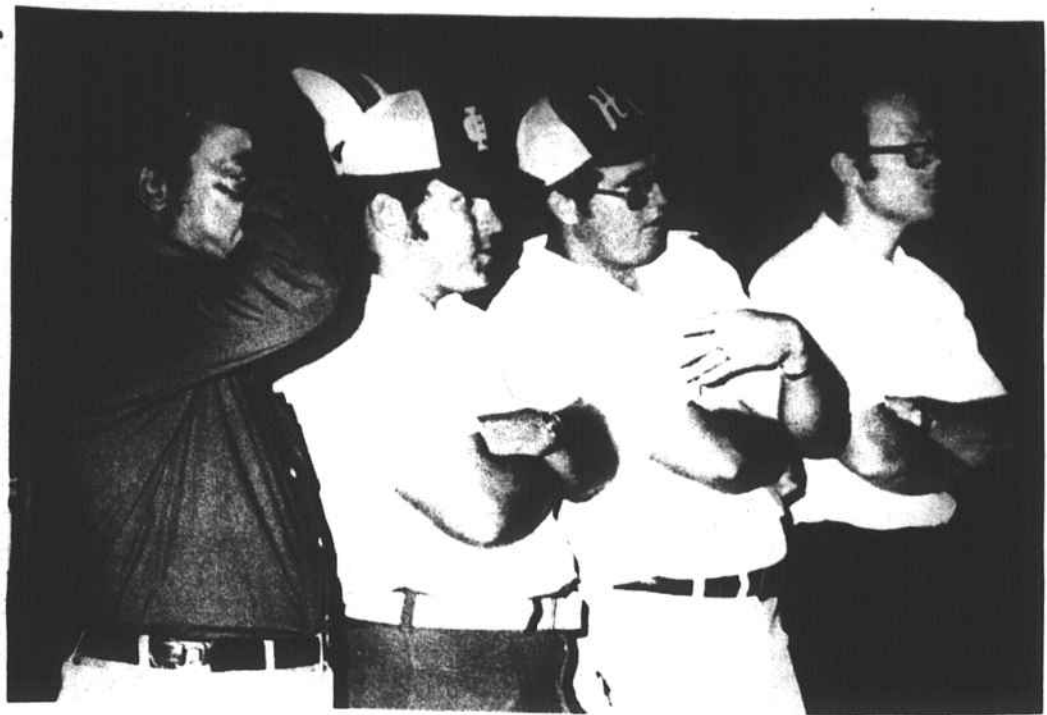
TOUGH SITUATION -- Hoke High School football coaches study the action taking place on the field during the Buck's 33-6 loss to Seventy-First Friday night.