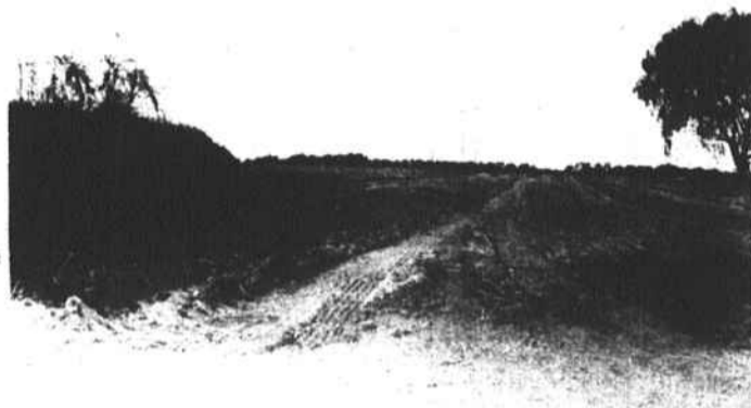
BY - PASS BEGUN - The highway department has begun work on Palmer Street for the construction of the 211 by-pass to link with U.S. 401. Some heavy equipment became stuck due to recent rain.