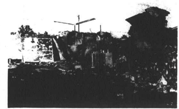
RUBBLE- An early morning blaze Nov. 17 left the County Line Grocery in rubble. SBI arson investigators are probing.

set Dec. 2 as date for appearance in Magistrate's Court to hear the eviction request.