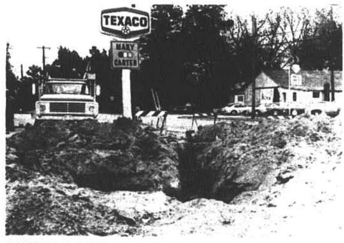
DIGGING- Bethel Rd. north of Harris Ave. was closed while workers dug away to put in sewer pipes. The street is slated for curbs and gutters.