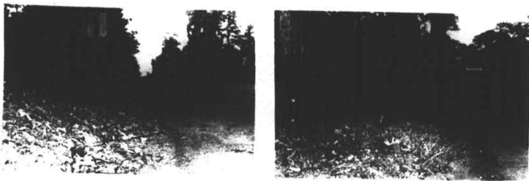
WRONG, AND RIGHT -Leaves raked into the curb as shown here on the left could block up the gutters if they become wet, the city warned last week. The right way is shown on the right, with leaves left well behind the curb for the city's pickup machine.