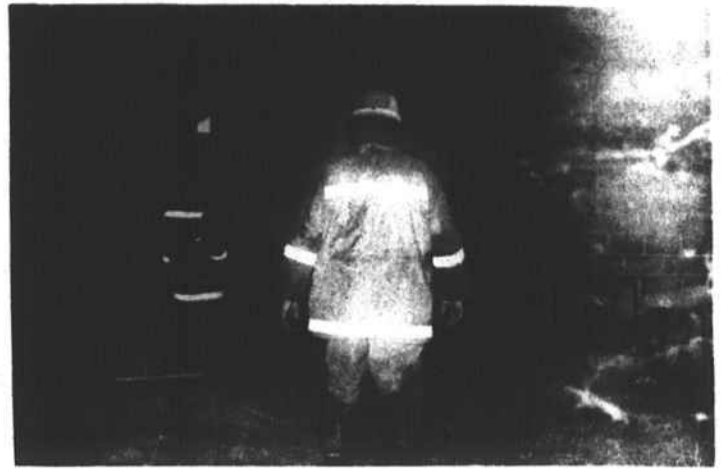
CHECKING IT OUT- Firemen rush to check damage done by a fire that broke out at Hoke High Stadium Monday morning.

Students reported that shortly after the fire, an announcement came over the school PA system that there was a $250 reward offered for information leading to the arrest and conviction of the perpetrator.