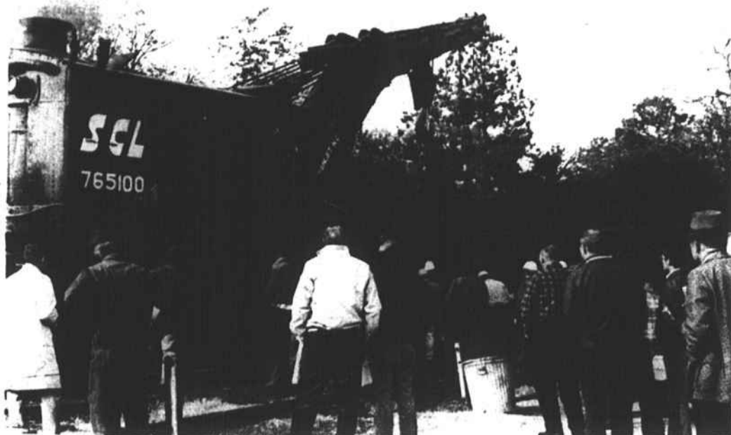
QUITE A CROWD - The derailed coal car last week brought quite a crowd of spectators to the tracks as workers from Hamlet replaced the car.

Kinlaw's Jewelry Store MAIN STREET RAEFORD