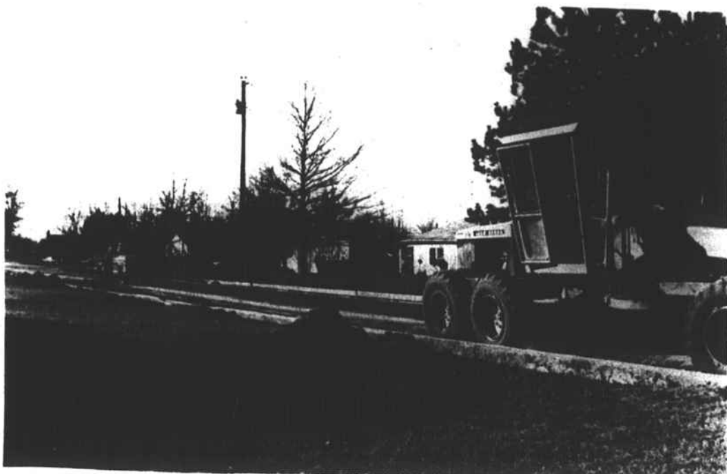
NEW CURBING - Construction of some of the roads north of Harris Avenue makes it hard to travel. The new curbing and drainage should help when it rains.