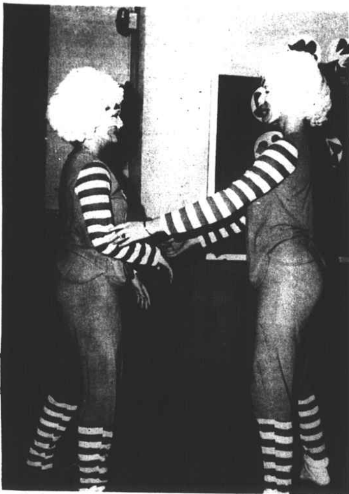
READY FOR A TUMBLE?—These two clowns displayed some acrobatics and tumbling tricks for the young people at the Sunnybrook Day Nursery last week.