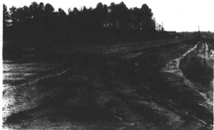
BY-PASS ROUTE - Grading of the 211 by-pass route which will link 211 traffic to U.S. 401 west of the city limits is well along on the stretch west of Thomasfield subdivision. Construction is funded under secondary roads allocation which was unused while the proposed link was in dispute.