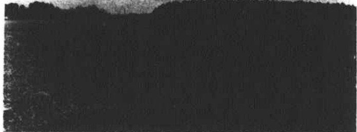
CURIOUS - Enjoying the warm sun and balmy temperatures last week, this steer interrupted grazing to peer with a curious look at a passing photographer, and scratch his ear.