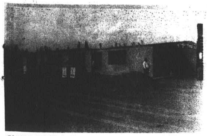
CONSTRUCTION- Another store is going up on Hwy 211 between Antioch and the county line. This business is locating about two miles from the line.