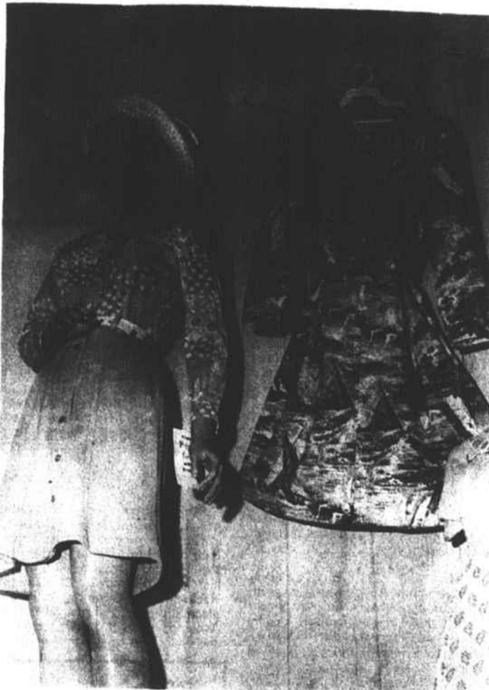
SPRING - Although cold weather is still with us, store windows are displaying white hats and colorful spring fashions.