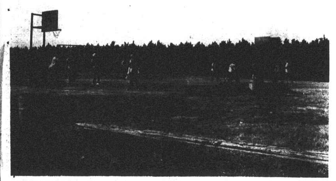
PLAYGROUND- Warm weather last week brought out crowds to the Robbins Heights playground, and this group of youths had a spirited basketball game going.