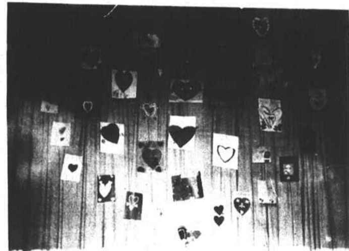
VALENTINES- Shown are the winning cards in the valentine contest held at Scurlock School. Judging was done on creativity, skill, and effort. The valentines were personalized by the students and later given to residents of the Open Arms Rest Home.