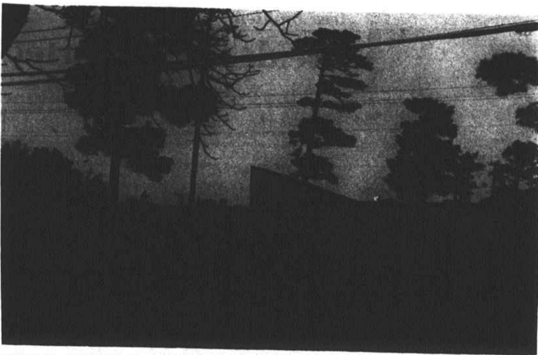
LIBRARY - Work on the Bicentennial library building on Main St. is progressing all the time and officials are hoping the work will be completed in time for a July 4 opening ceremony.