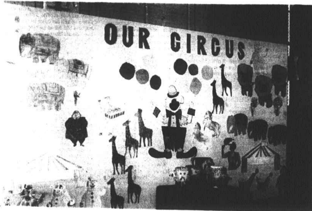
CLASSROOM - Imaginative decorating in Miss Purcell's kindergarten classroom at West Hoke School brought compliments from the state coordinator on a recent visit. Paper cut-outs, hanging mobiles, and original drawings and displays fill the room. Pictured here is a circus board which was put together while the pupils learned all about animals.