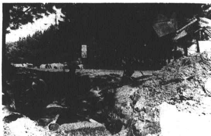
DIGGING -- Traffic on Bethel Rd. at the high school slowed as cars had to maneuver their way around workmen digging the drainage for the nearby residential area.