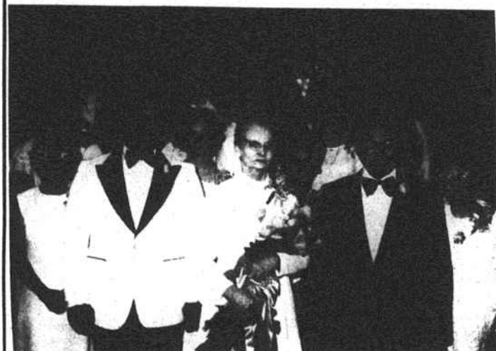
NEW CORPS OF OFFICERS - Raeford Chapter No. 226, Order of the Eastern Star.