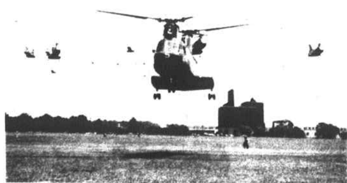
ON DISPLAY -- This CH-46F Sea Knight is one of the aircraft on display at the annual Cherry Point Marine Corps Air Station open house on Saturday, May 1 from 10 A.M. to 4 P.M. Also featured will be famous Blue Angels precision flying team, the Navy's parachute team, and a demonstration of the marine Corps' AV-8A Harrier, the only high performance jet capable of vertical takeoff and landing. The public is invited and admission is free.

Although the high divorce rate has accentuated the number of men and women living alone, the big build-up has been among the young singles. There has been an increase of no less than 50 percent, between 1970 and 1975, in singles in the 25 to 34 age group, reports the Census Bureau.