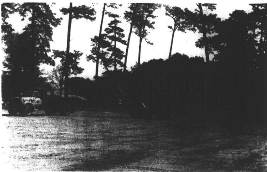
CONSTRUCTION—Work has begun on three tennis courts in the McLaughlin playground area, which are expected to be ready by summer. Costs of the new courts is being paid out of this year's recreation commission budget.