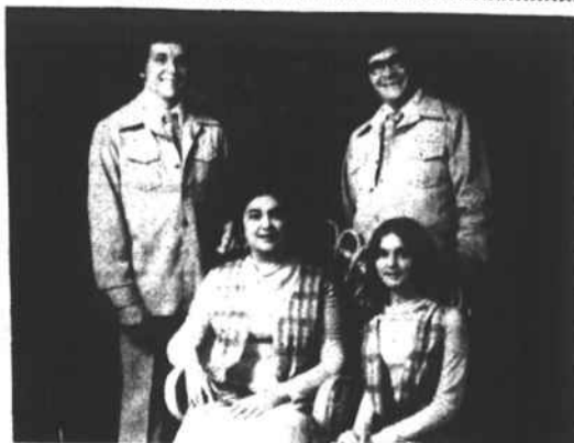
The Canaan Heirs of St. Pauls will be at the Church of God on Green St. June 6 for a special singing. Service will begin at 7:30 P.M. The public is invited to attend

It takes about 1 hour and 32 minutes to take care of all housing costs. Total expenses for transportation takes around 39 minutes of the paycheck. Medical care takes 25 minutes.