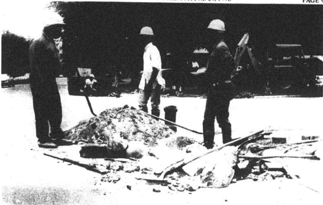
REPAIR—City water was shut off to a portion of the downtown area for two hours Monday morning while repair crews worked at the Magnolia St. and W. Edinborough Ave. intersection. A hit and run driver knocked down the fire hydrant in front of the Presbyterian Church over the weekend.

P.S. People who never had flies don't know how to appreciate the lowly screen. Children ask grandmother or great grandmother about this little black fly that didn't bite or sting yet was a terrible pest.