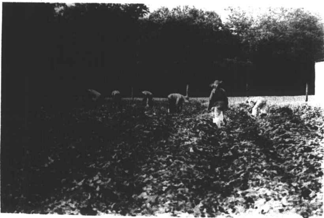
HARVEST —Cucumbers are being harvested now in many parts of the county. This group of workers was up early Tuesday morning working in a foggy field off the 401 bypass.