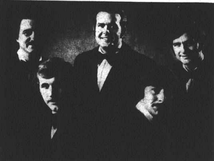
CONCERT - On Sunday, July 11 at 7:30 p.m. The First Baptist Church of Raeford will host a benefit concert by the Pioneers. All proceeds will go to the "Mission 76" project in which 24 youth from the church are scheduled to leave for Middlefield, Ohio on July 30. The trip will include a week of Mission Vacation Bible School as well as nightly choir concerts for this pioneer mission area. There is no admission charge and the public is cordially invited to attend.