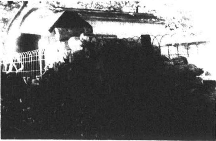
SIGN OF WINTER -- Despite balmy temperatures last weekend, winter is getting closer and firewood is being stacked up in backyards, ready for cozy fires on the icy nights to come.