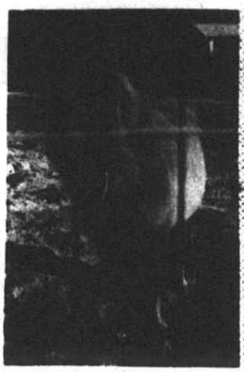
PRISONER -- A pony can be a prisoner behind bars, even if it has got more room than a jail cell. A pony can at least get a view of the outside world and get a good hard gaze at anyone who happens by.