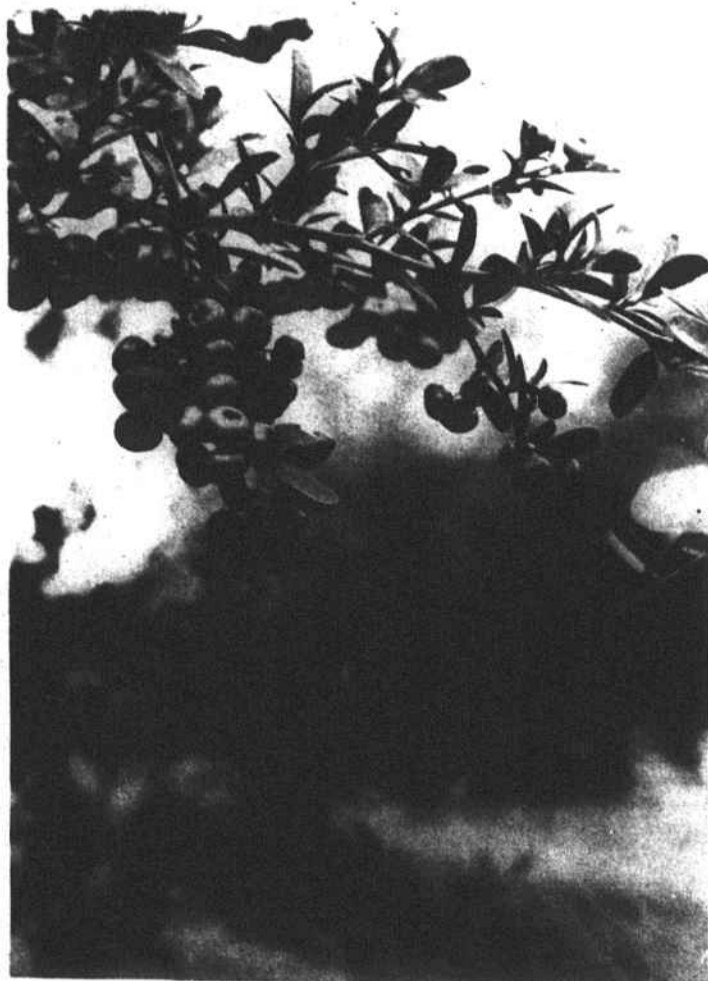
DECORATION -- Mother Nature has begun her holiday decorations as evergreen nandina bushes begin to bear scarlet fruit in the county. Perhaps the next step in her exterior decoration plan will be a soft white background.

or write "Dinner Theatre" % Pinehurst Hotel, Pinehurst, N. C. 28374