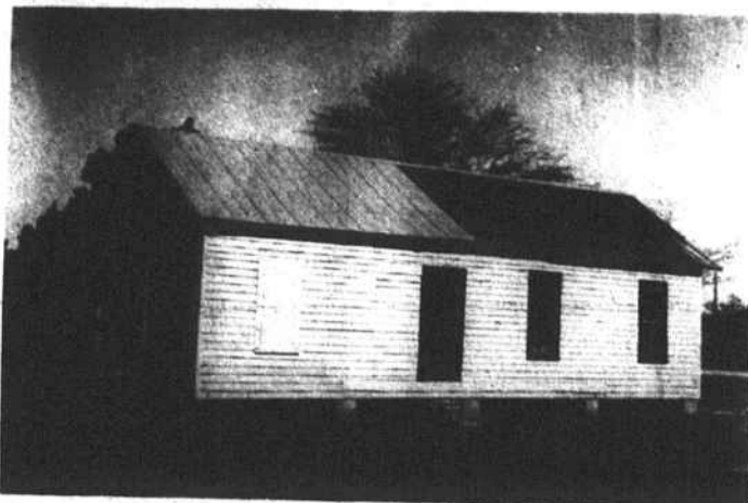
SCOUTS' HOME -- Z.V. Pate Inc. of Laurel Hill donated this house to Boy Scout Troop 434. If the Scouts can interest community groups in helping furnish their new meeting place, they hope to be able to move in by next February.