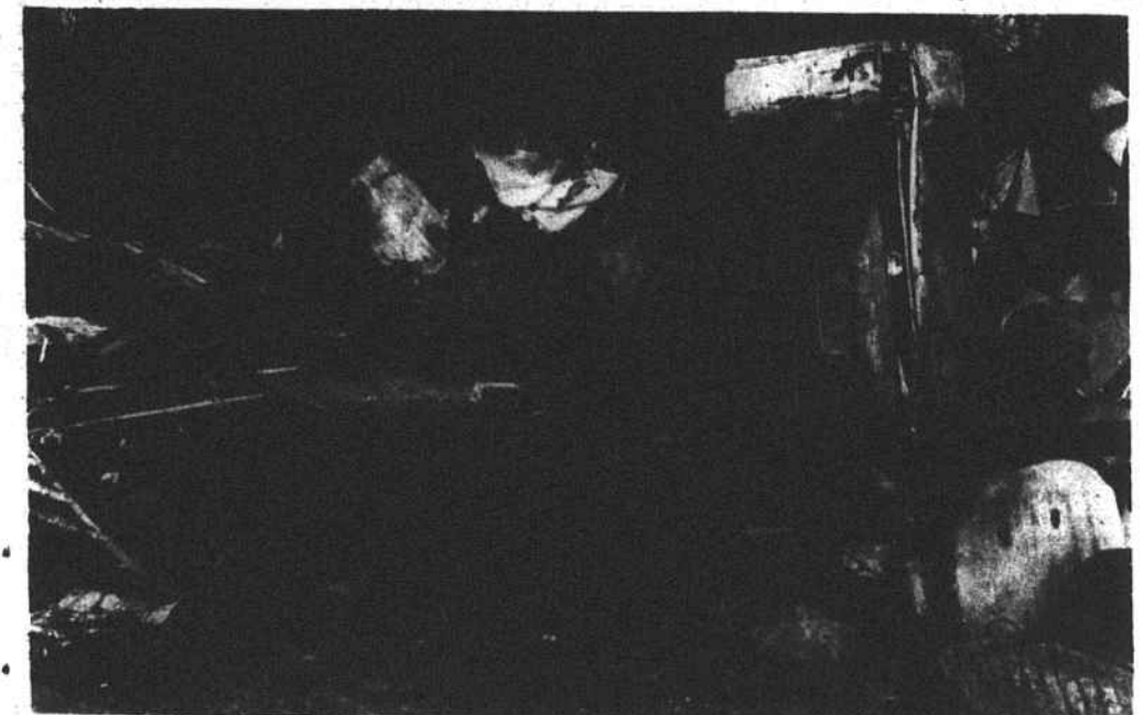
FIRE - Raeford Fire Department volunteers were called out late Wednesday afternoon last week to 404 W. Sixth Ave. to fight a fire which broke out in a storage building. The fire was already out of control when firemen were called but the flames were doused before the blaze could spread to the nearby residence. Apparently no one was at home at the time.