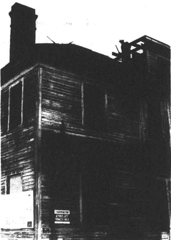
GOING DOWN -- Workmen began dismantling the old Maultsby home on Central Ave. Monday. A point of controversy in the community for some years now, the frame dwelling will be leveled to make room for a parking lot.