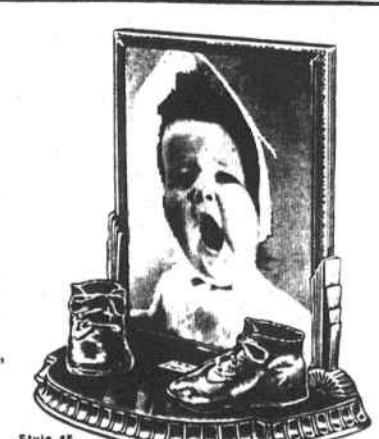
Style 45 Portrait Stand with 8x10 or 5x7 frame

Style 51 Bright Bronze UNMOUNTED SHOE Reg. $7.95 SALE $5.96