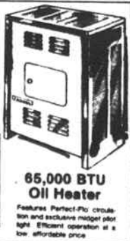
65,000 BTU Oil Heater Features Perfect-Fit combustion and exclusive motorized pilot. Efficient operation at a low affordable price.