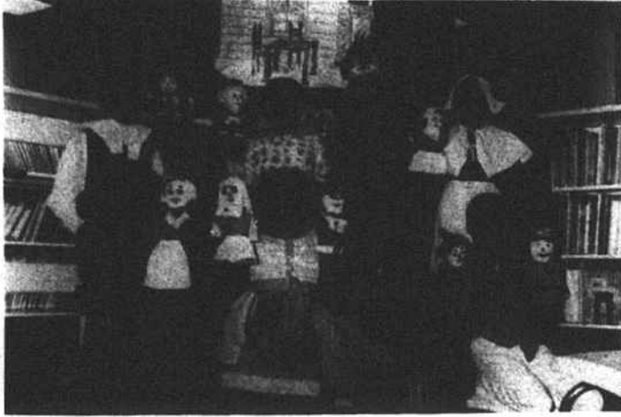
PUPPET SHOW -- These students are displaying the puppets used in a show at Scurlock School last week.

After the play students were invited to ask questions. The play depicted the events of the first Thanksgiving and provided a learning experience through entertainment.