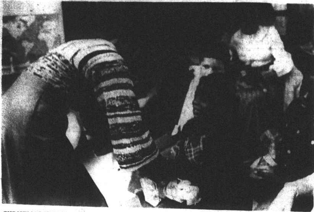
CHRISTMAS PARTY -- A Christmas party for exceptional children at Upchurch Junior High School was held here last week. The group was serenaded with Christmas carols by one of the classes at the school, and presents were handed out to everyone.