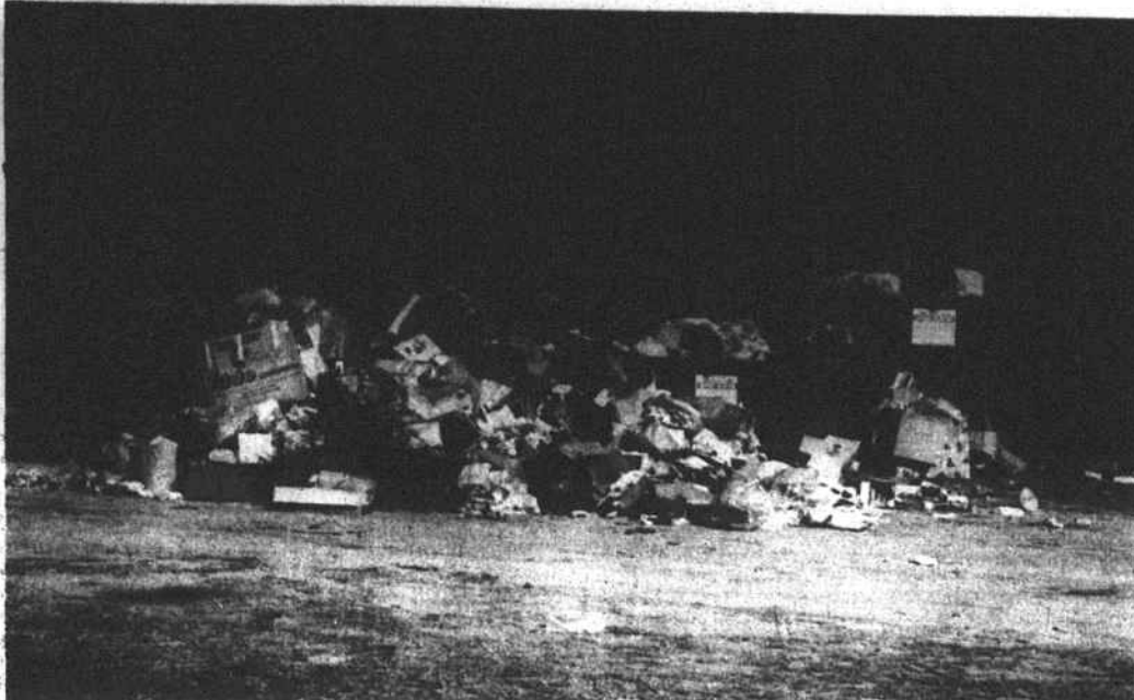
CHRISTMAS PAST -- Christmas is over, but the memories linger on. This picture was taken Tuesday afternoon after a Hillcrest citizen came in to complain about the garbage overflowing the dumpsters. While city residents were relieved of their Christmas trash on Monday, county residents must put up with unsightly remnants such as this until garbage collections are made. These dumpsters are located on Highway 401 Business.

The News-Journal makes every effort to publish only reliable ads. We urge our readers to carefully consider their investment and if you have doubt regarding the offer, to investigate carefully.