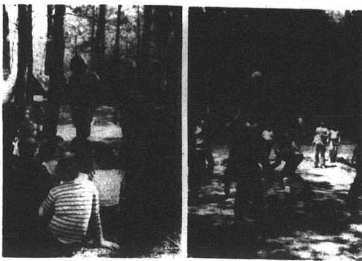
CAMPING TRIP - Members of local Cub Scout Pack 404 enjoyed a father-son camping trip over the weekend at Lafayette Woods Pond. Scouts are shown above playing volleyball and learning how to tie knots.

It was a time for dads to get to know their sons and vice-versa. It is this kind of parent participation that makes cub scouting successful and so enjoyable to the boys. A hearty thanks to all who participated from the Webelos Den Leaders of Pack 404.