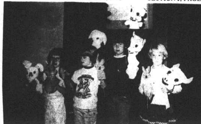
PUPPETS -- These kids will take part in the Hoke County Arts Council's Art in the Park day next Sunday. They will present puppet plays as part of the entertainment for the event.

THE NEWS-JOURNAL RAEFORD. NORTH CAROLINA THURSDAY, APRIL 27, 1978 SECTION 1, PAGE 9