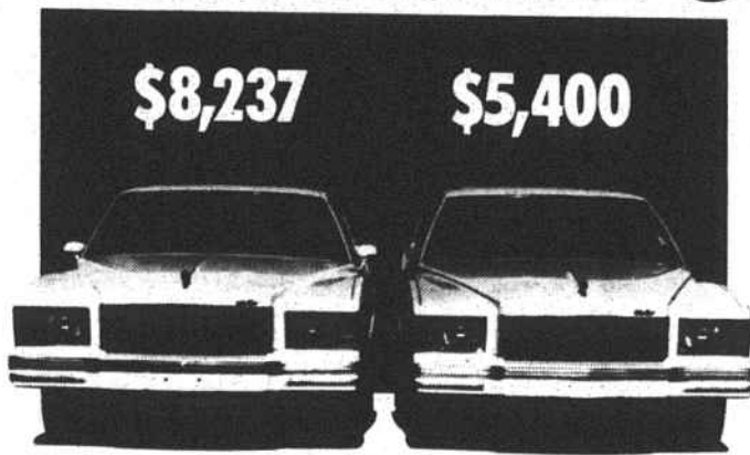
New car, or late-model used car? The differences are small, except on the price tags.

If you're in the market for a new car, maybe the model that's right for you is last year's.