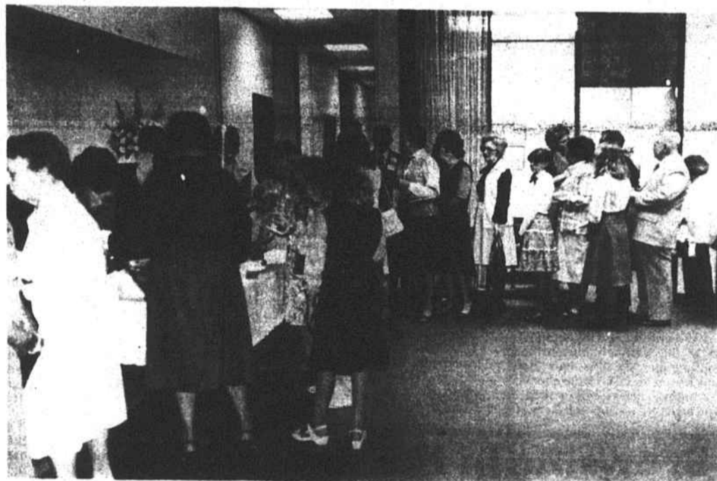
REFRESHMENTS FOR VISITORS -- Visitors at the grand opening of The Bank of Raeford's new building are served refreshments in the lobby during the tour of the offices Sunday afternoon.

The Bank of Raeford's new main office building at 207 S. Main St. was opened formally Sunday afternoon, and about 1,100 people toured it before it closed for the day at 6 p.m., after the ceremonial red ribbon across the front entrance was cut about 2 1/2 hours before.