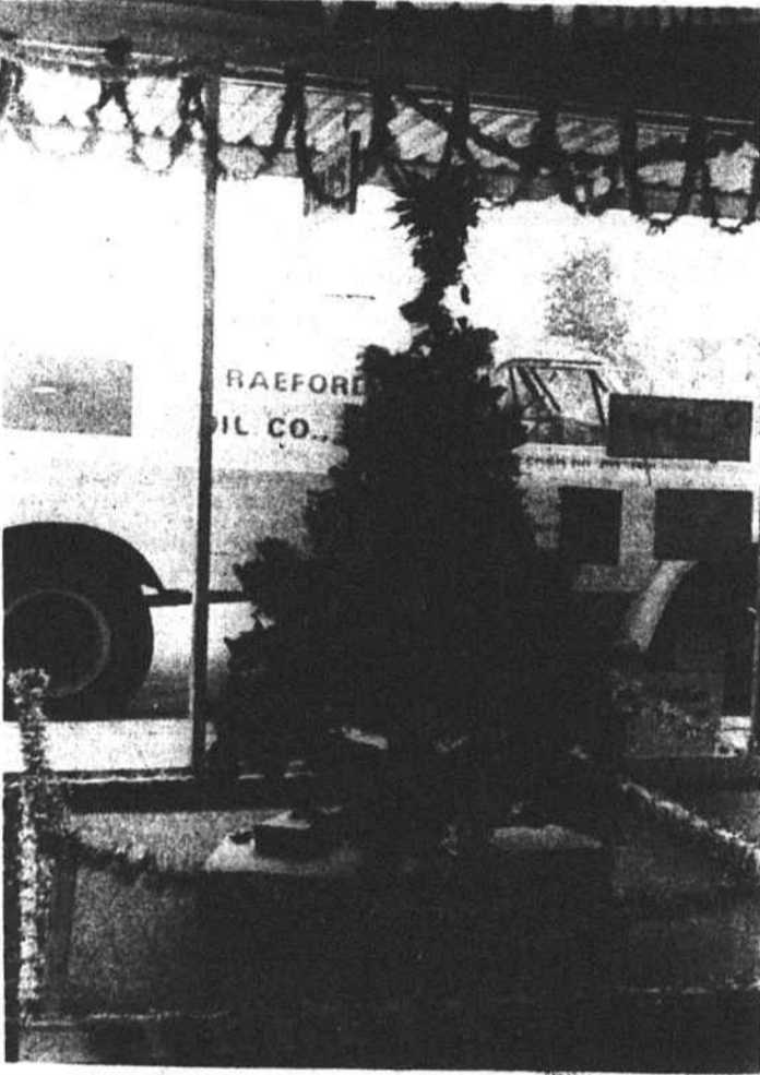
MEMO: IT'S PRACTICALLY IN SIGHT -- These are among the signs which appeared in Raeford in recent days telling us that Christmas is not far away. The decorated Christmas tree with Christmas-wrapped gifts are