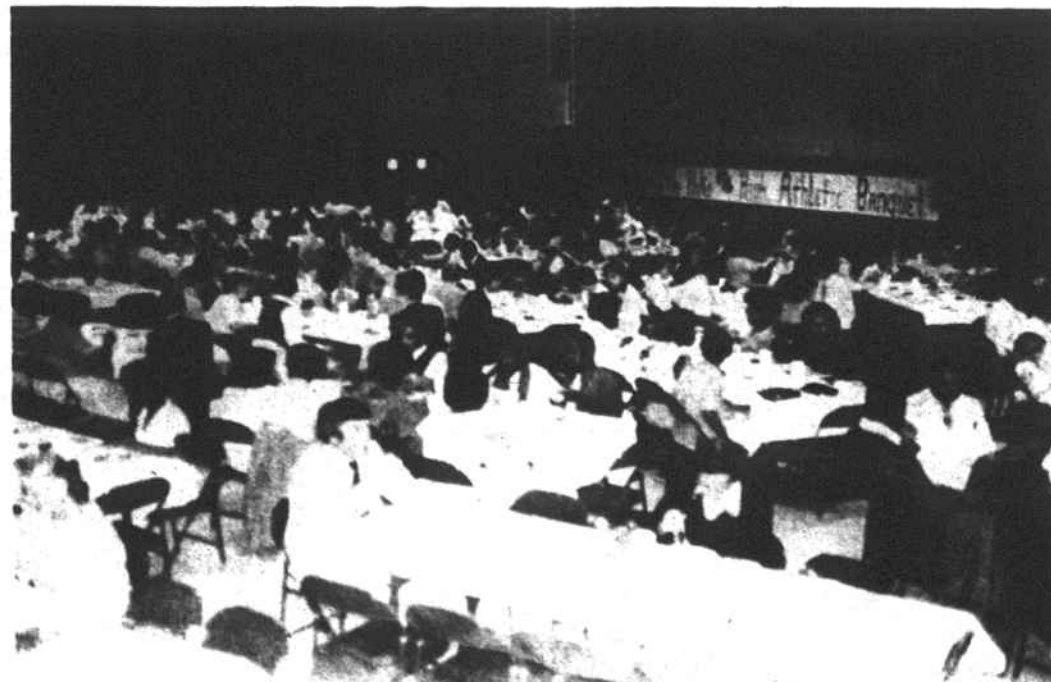
Some of the diners during the annual Athletic Banquet at Hoke High.