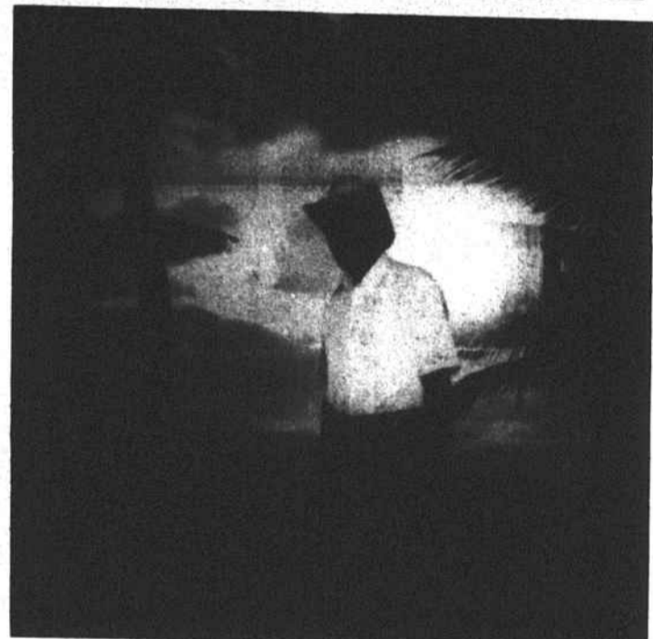
Grady McRae, Sr., at reunion.

Chatham Dog Food 5 lb. bag 99¢ Chatham Chunk Dog Food 10 lb. bag 229 Page Toilet Tissue 4 roll 69¢ Kleenex Tissue 30 ct. 2 for 99¢