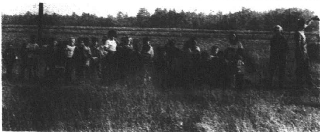
Students who were on the school bus in the accident but were uninjured are shown waiting with adult escorts for the substitute bus dispatched to take them the rest of the way to classes.

When classes ended, three of the seven regular bus drivers hadn't appeared at school to take the children home, but were replaced by others. South Hoke Principal Woodrow Westall said none of those who failed to appear for the