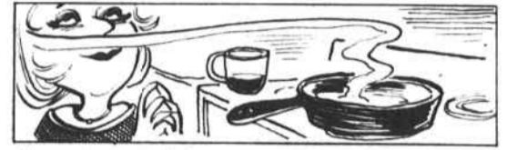
A quarter cup of vinegar on the stove next to frying foods can help get rid of offensive odors.

Cotton production is expected to total 80,000 bales, same as forecast a month earlier, but 54% more than 1980's crop. Acreage is up 23% and yield per acre is up 26% from 1980.