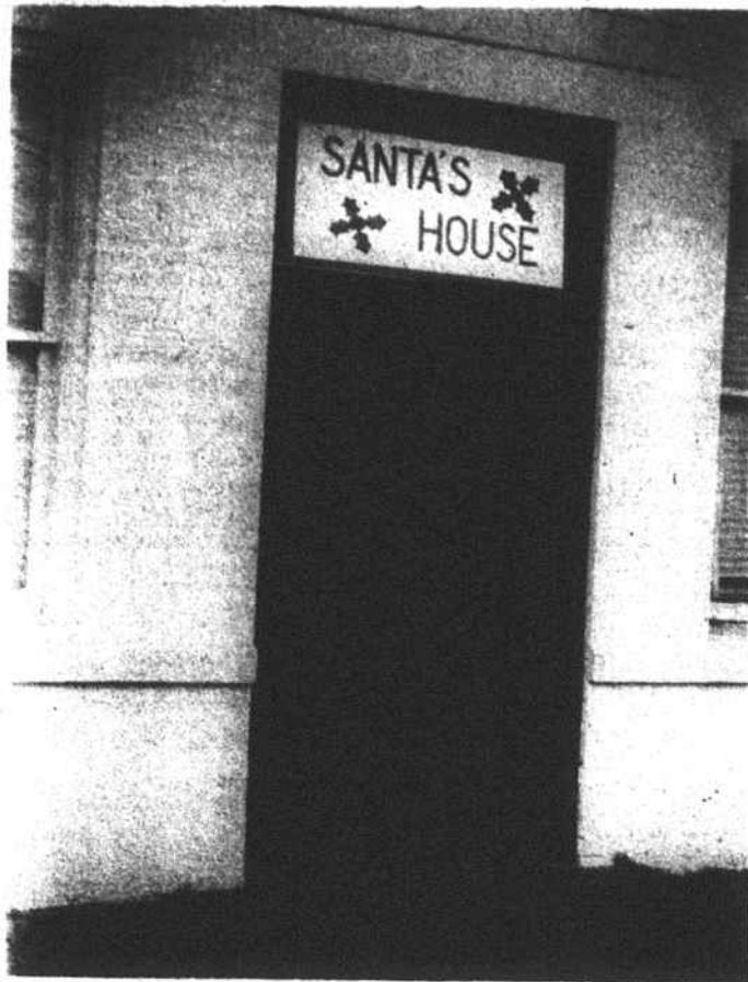
The sign tells what is here. Santa will enter Saturday after the Christmas parade through downtown Raeford.