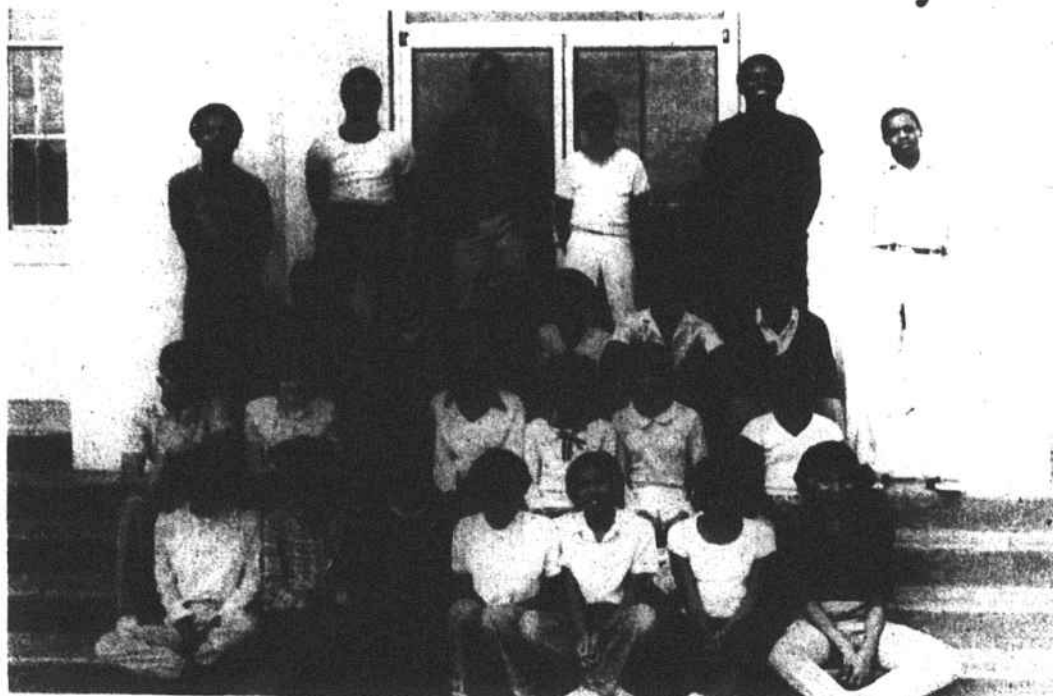
The dance group of Upchurch Junior High will perform in the play December 15 with the Drama Club.