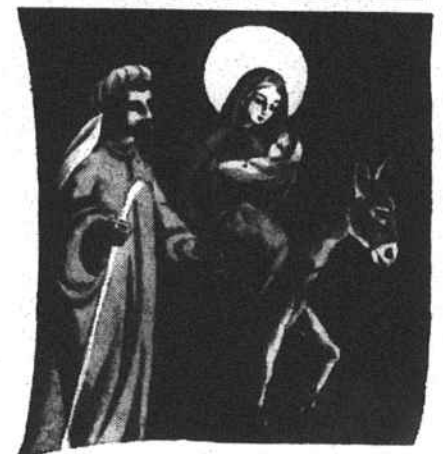
Come, let us adore the newborn King! May the joy of Christmas dwell in every heart!