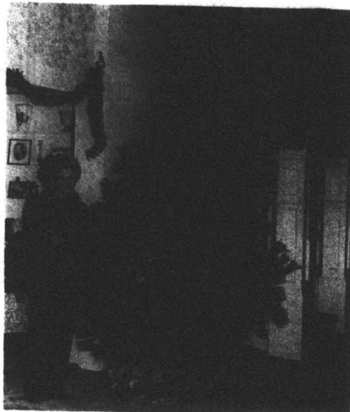
The Austin Home 131 W. Edinborough